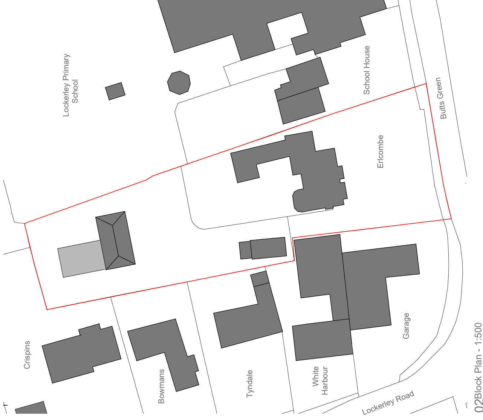
02 Block Plan - 1:500