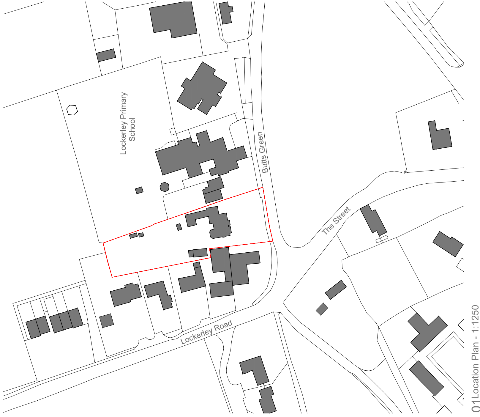
01 Location Plan - 1:1250